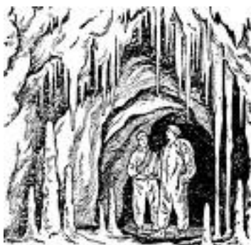
Stalactites and stalagmites.