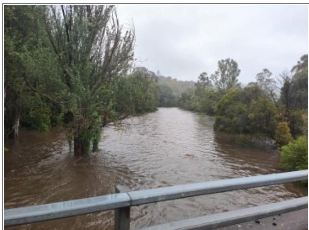
The Buchan River in flood (early Dec 2023)