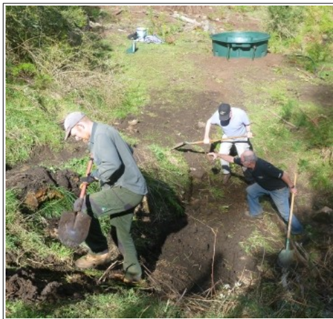
Lots of work digging and trenching to bury the water pipe for the trough (ack: Neil Wilson)

The whole task went very smoothly as Paul Brooker had planned the fence completion,