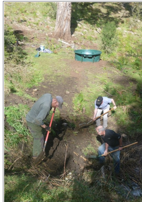
Another view to put the location into perspective