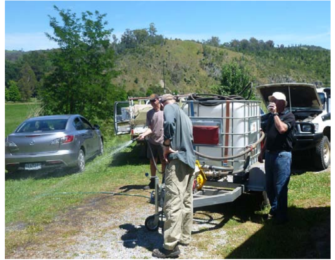
Playing with the fire trailer, November 2013

Fires threatened Buchan in early February this year. A number of members heeded a call to keep Homeleigh occupied during the danger period to watch for fires. The grounds were further tidied and leaves, grass and litter were removed particularly material close to the buildings. The fire trailer was ready and soaker hoses put around the outside of the house. Directors and members are very appreciative of members who stayed at Homeleigh through this danger period and worked so hard to keep the property safe.